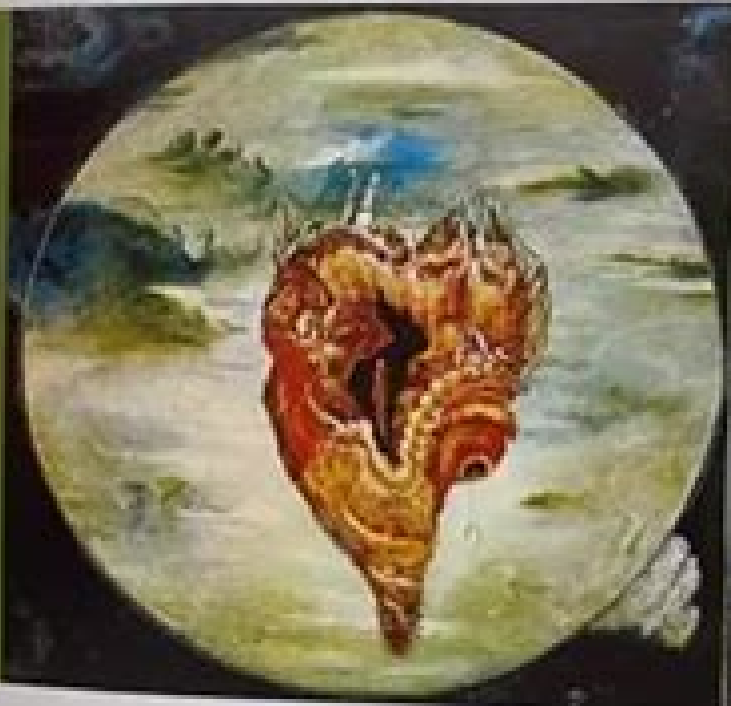
"LA TORRE DE BABEL" 1793, 1794 / G. B. Piranesi 1988