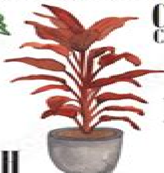
H Hawaiian Ti Plant