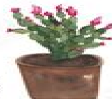
E Easter Cactus