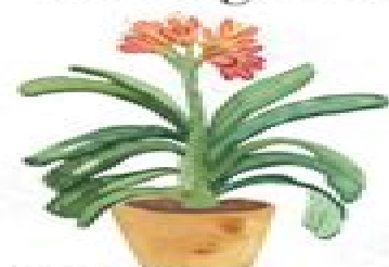
K Kaffir Lily