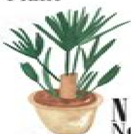
N Needle Palm