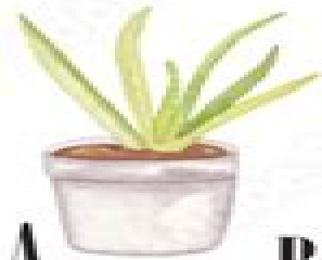
A Aloe Vera