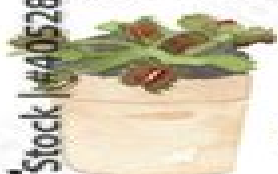
V Venus Fly Trap