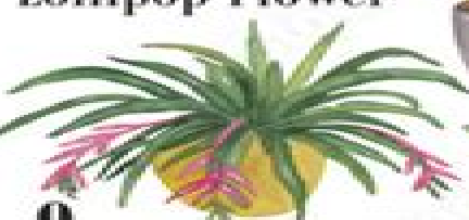
Q Queen's Tears