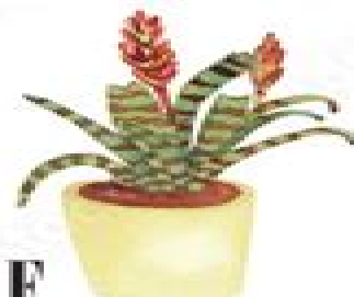
F Flaming Sword