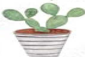
B Bunny Ears Cactus