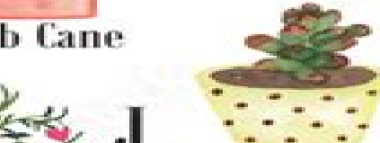
J Jelly Bean