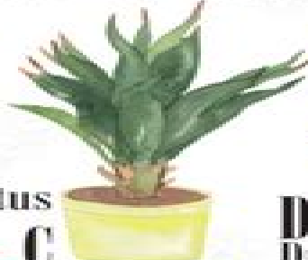
C Century Plant