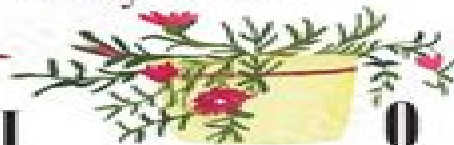
I Ice Plant