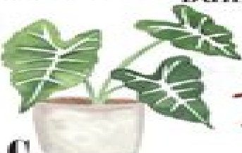
G Green Velvet