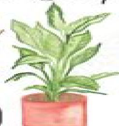
D Dumb Cane