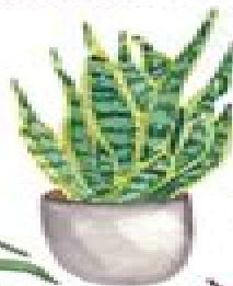
M Mother In Laws Tongue