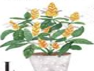
L Lollipop Flower