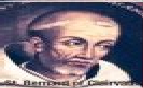
St. Bernard of Clairvaux