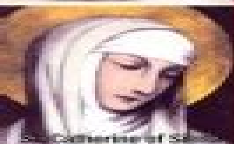
St. Catherine of Siena