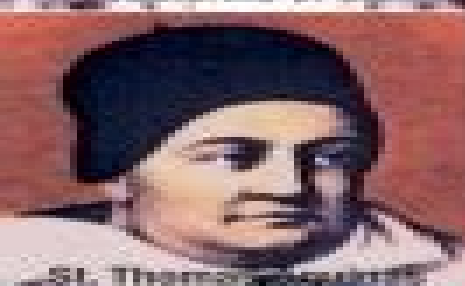
St. Thomas Aquinas