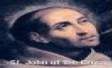
St. John of the Cross