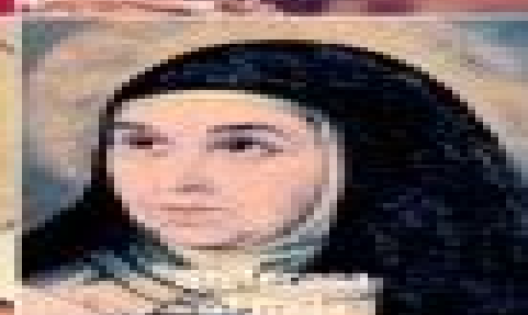
St. Hilary of Poitiers