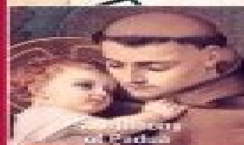
St. John of Padua