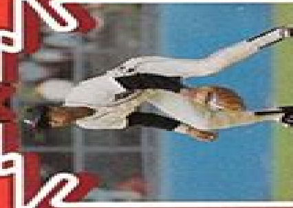
LOU WHITAKER Detroit Tigers Batter of the Year

NEW YORK YANKEES BOSTON RED SOX MILWAUKEE BREWERS BALTIMORE ORIOLES DETROIT TIGERS CLEVELAND INDIANS TORONTO BLUE JAYS