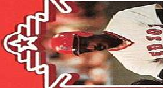
JIM RICE Boston Red Sox Most Valuable Player