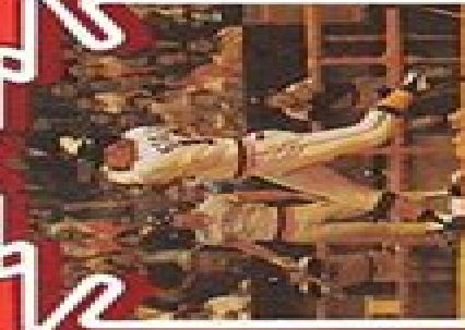
RUSTY STAUB Detroit Tigers Outstanding Designated Hitter

KANSAS CITY ROYALS CALIFORNIA ANGELS TEXAS RANGERS MINNESOTA TWINS CHICAGO WHITE SOX OAKLAND A'S SEATTLE MARINERS