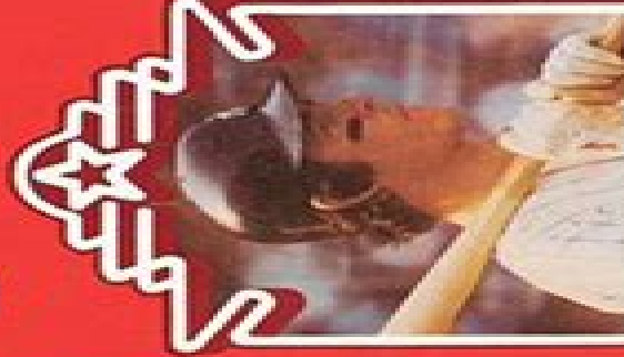
BUCKY DENT New York Yankees World Series M.V.P.