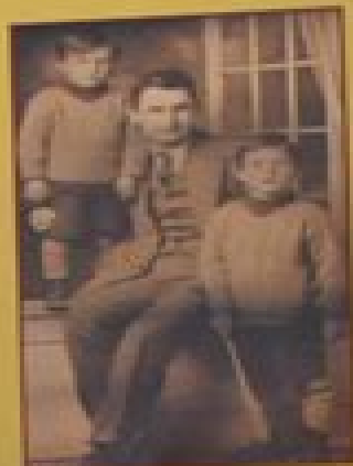
T hat Biddle Boy From Philadelphia,