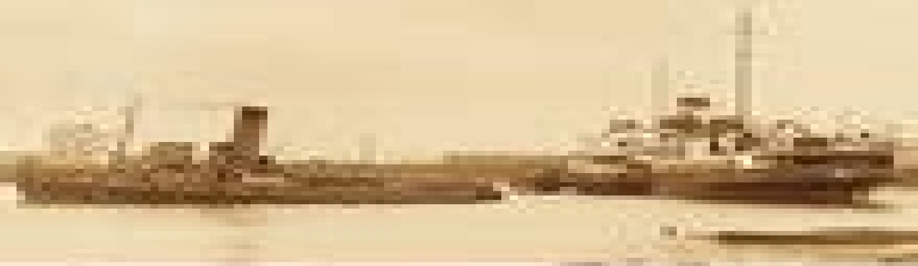
THOMAS FLETCHER STEAMSHIP BUILT 1845 (REPRODUCED FROM 1850-1860)