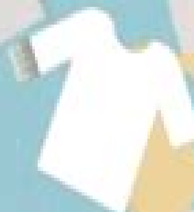
SUN DRY CLOTHES