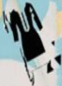
CLOTH INSIDE OUT