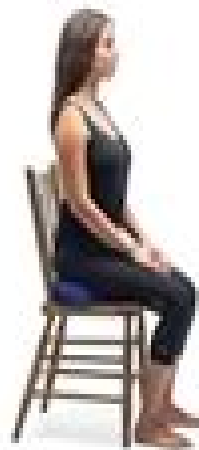
Cushion on Chair