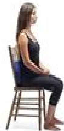
Cushion Behind Back