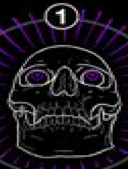
1 pride or vainglory

also called seven capital sins or seven cardinal sins. In Roman Catholic theology, these are the seven vices that spur other sins and further immoral behaviour. They were first enumerated by Pope Gregory I (the Great) in the 6th century and elaborated in the 13th century by St. Thomas Aquinas.