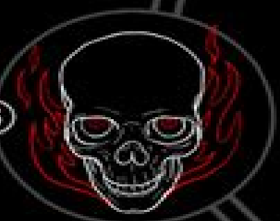
6 wrath or anger