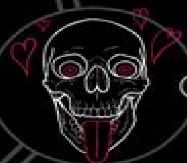
3 lust or inordinate or illicit sexual desire