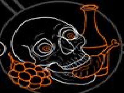
5 gluttony including excessive drinking