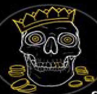
2 greed or covetousness