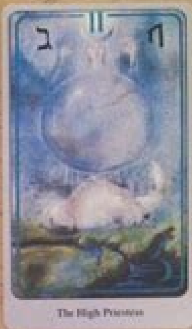
The High Priestess