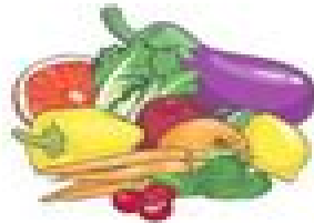
Eating Veggies with Every Meal