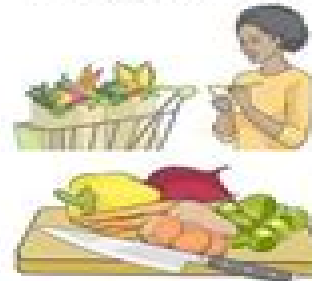
Cooking/Prepping One Meal Per Day