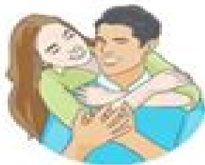
Spending Quality Time with Family/Friends