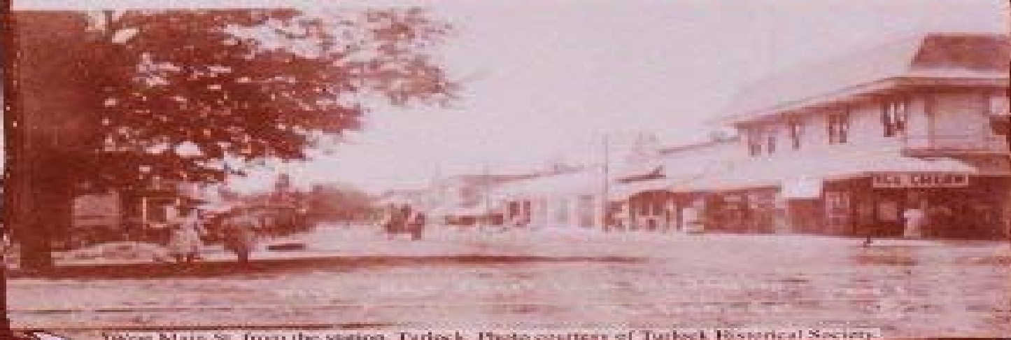
West Main St. from the station, Turlock.