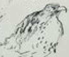
The hawk stayed by the hill. Stopped to take prey and she called out. This hawk later she was still there.