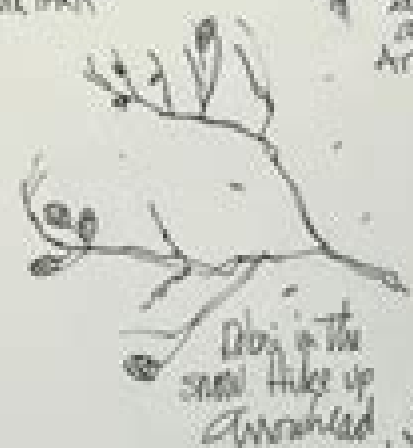
Down in the snow. Hike up Arrowhead