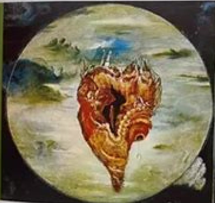
"LA TORRE DE BABEL" 1793, 1794, 1795, 1796, 1797 1798