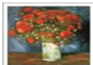
VAN GOGH Poppies