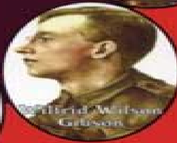
Wilfred Wilson Gibson