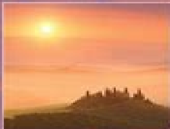
SUNRISE, TOSHOJI, JAPAN