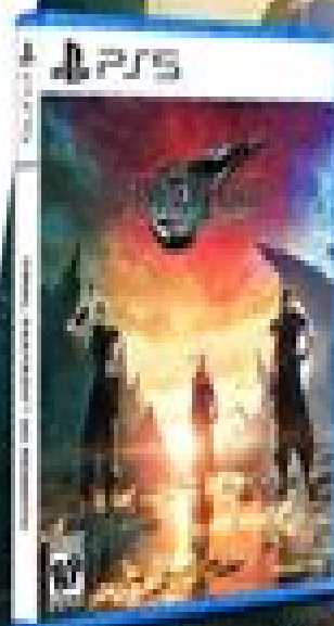
FINAL FANTASY VII REBIRTH GAME WITH REVERSIBLE COVER