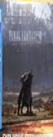
EXCLUSIVE MIDGAR BANGLE