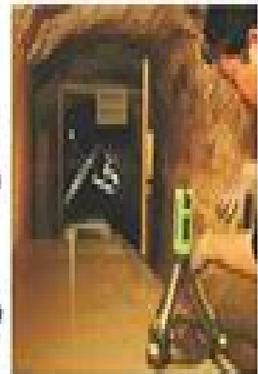
Detectors being set up in Queen's Chamber

The technology measured muons, a by-product of cosmic rays from stars exploding in the universe and raining down to earth at nearly the speed of light. More muons pass through voids than through stone, as stone absorbs them. Detectors were placed in the Queen's chamber, the descending passageway and outside the pyramid near its north face.