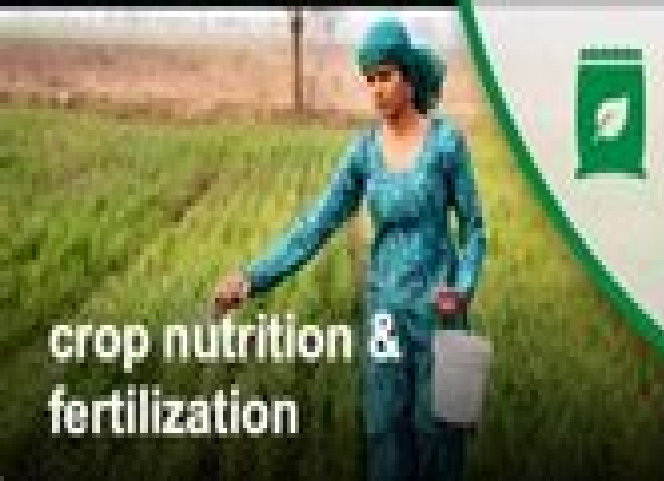
crop nutrition & fertilization