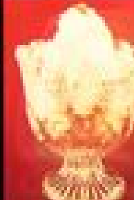
21. CHOCOLATE A swirl of chocolate ice cream topped with a cherry and a dusting of cocoa powder.