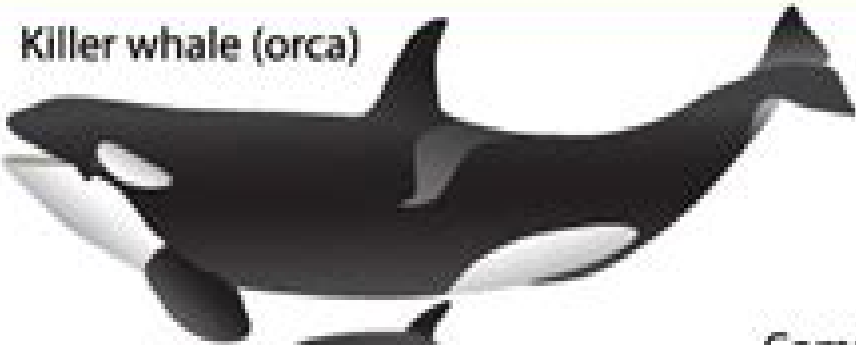
Killer whale (orca)