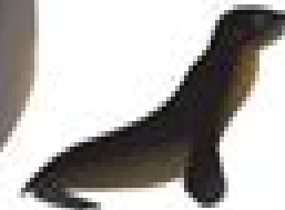
Northern elephant seal