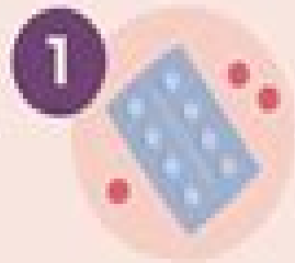
1 Ovarian Hyper- stimulation