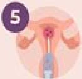
5 Embryo Transfer