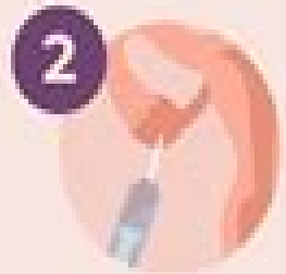
2 Egg retrieval