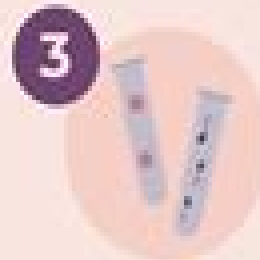
3 Egg and Sperm Preparation