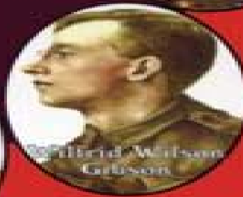
Wilfred Wilson Gibson