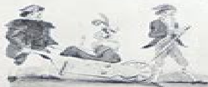
OLD WOMAN OF STAMFORD.

There was an Old Woman of Stamford, Who lived in a Wheelbarrow, And her services before, Reached out at each door, To assist the Old Woman of Stamford.