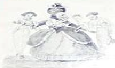
OLD WOMAN OF LONDON.

There lived an Old Woman Whose Name every man You may easily suppose She had plenty of; This charming Old Woman