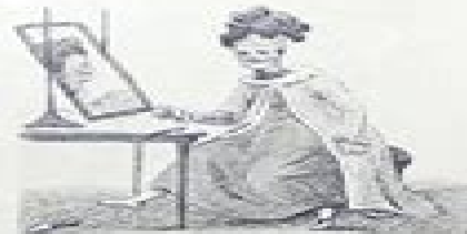
OLD WOMAN OF GOSPORT.

There was an Old Woman of Gosport, And she was one of the most rare, When she drove to the Old Bell, Her wig was too small, Which suited this Old Lady of Gosport.