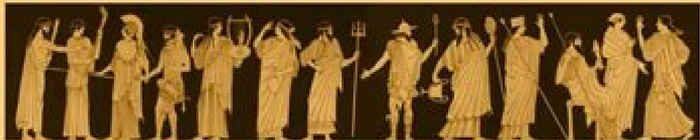
Athena Hermes Apollo Poseidon Hermes Dionysus Hera Zeus Hades

Hades: brother of Zeus, ruler of the underworld