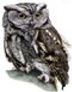
WESTERN SCREECH OWL