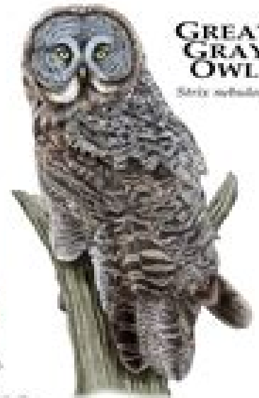
GREAT GRAY OWL