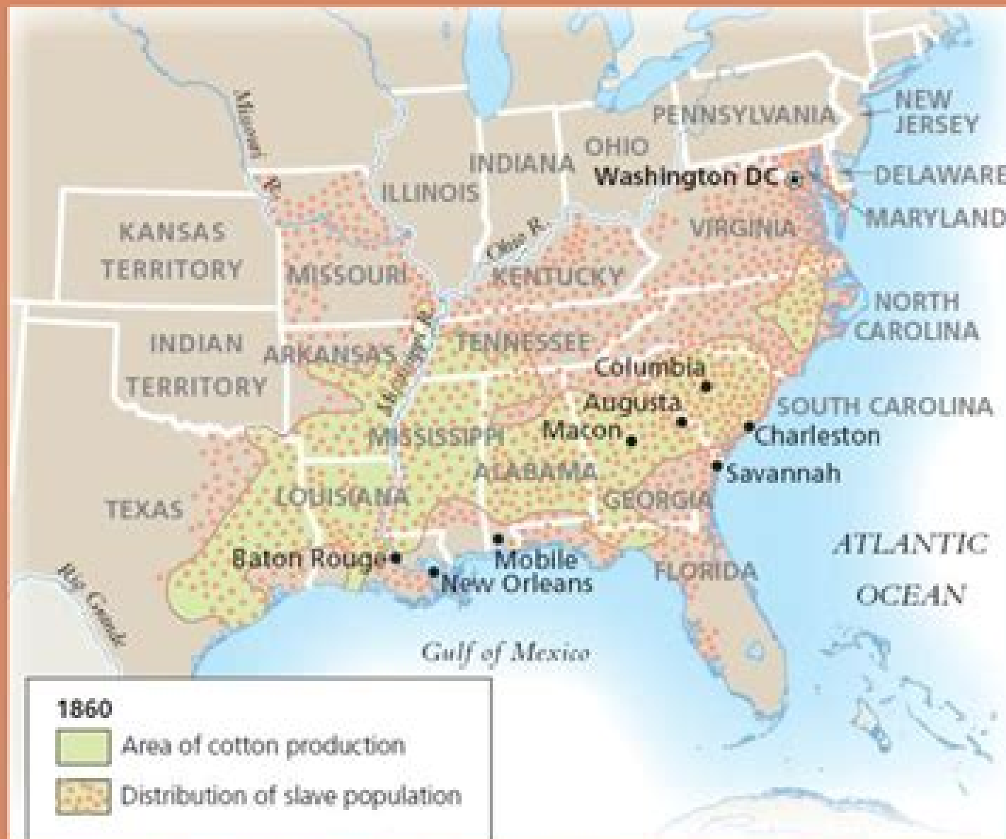
MAP 10.2b Cotton Production and the Slave Population, 1860.