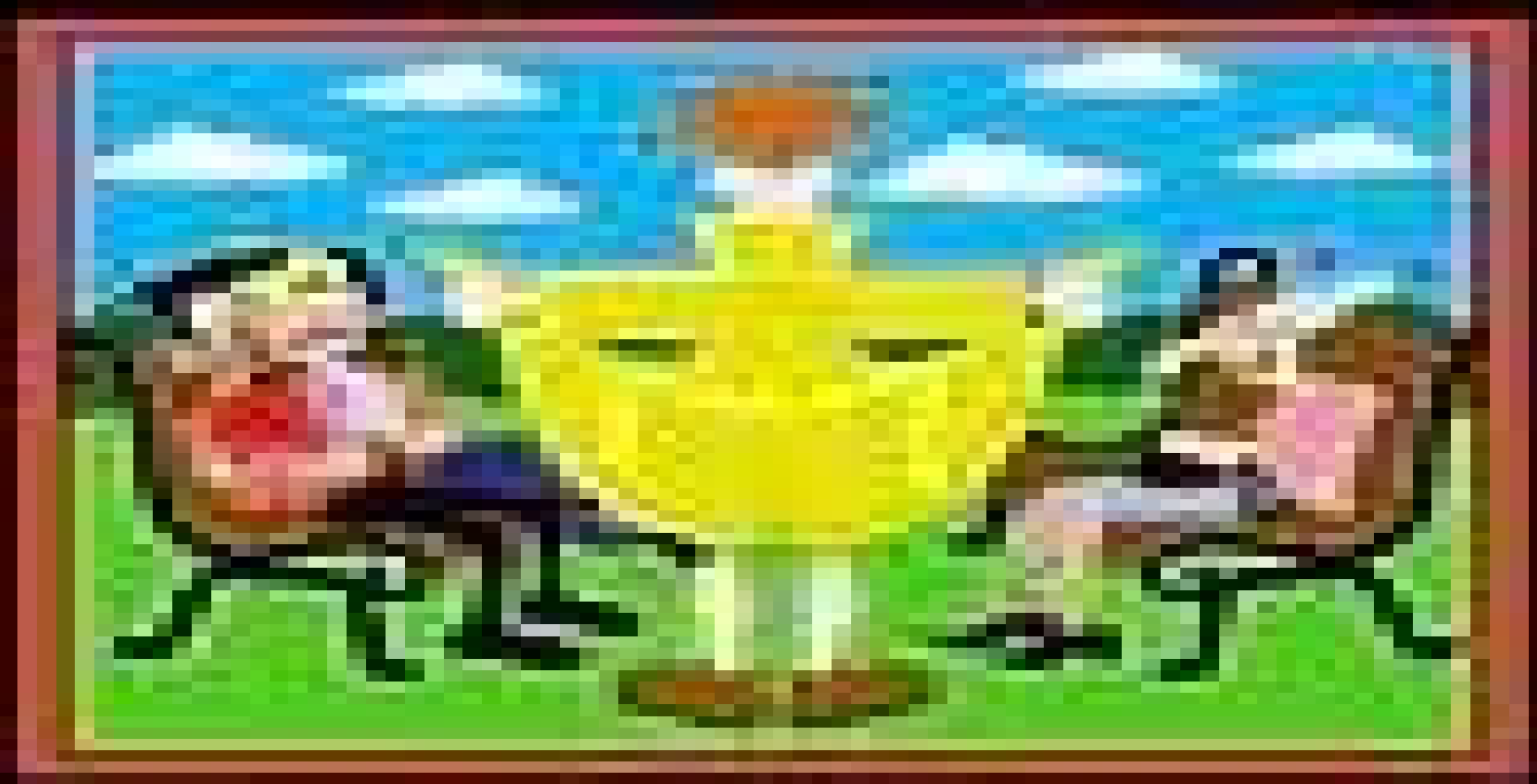
ILLUSTRATION BY JOHN J. BROWN

— A GUIDE TO THE LANGUAGE OF AMERICAN AND BRITISH COMICS —