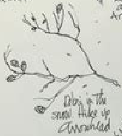
Down in the snow. Hike up Arrowhead