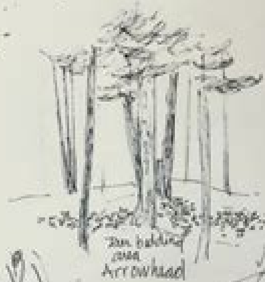
San holding near Arrowhead