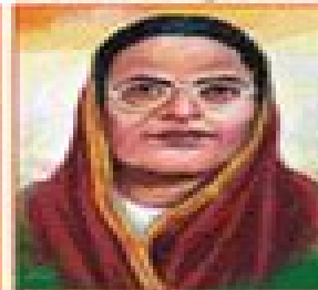
रामबाई रानडे Ramabai Ranade