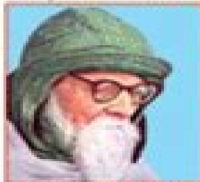
आचार्य विनोबा भावे Acharya Vinoba Bhave