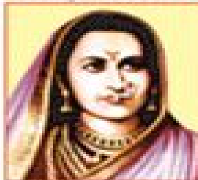
राजमाता जिजाबाई Rajmata Jijabai