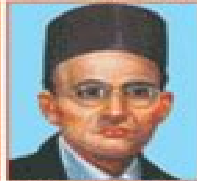
विनायक दामोदर सावरकर Vinayak Damodar Savarkar