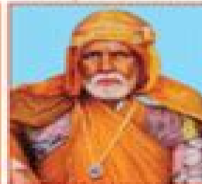
संत श्री गडगे बाबा Sant Shri Gadga Baba