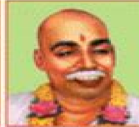
राष्ट्रवंत श्री तुकडोजी महाराज Rasthreevant Tukdoji Maharaj