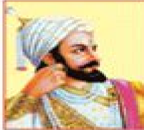
छत्रपती शिवाजी महाराज Chhatrapati Shivaji Maharaj