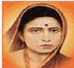
रामबाई अम्बेडकर Ramabai Ambedkar