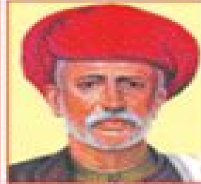
महात्मा ज्योतीबा फुले Mahatma Jyotiba Phule