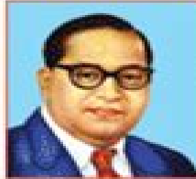
डॉ. बी. ए. अम्बेडकर Dr. B.R. Ambedkar