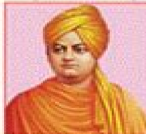
स्वामी विवेकानंद Swami Vivekanand