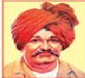
राजशी शाहु महाराज Rajshi Shahu Maharaj