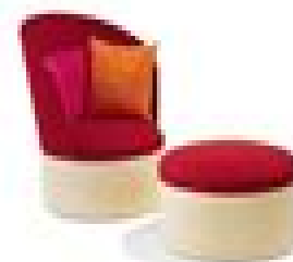
Contemporary Furniture 1980-Present