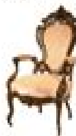
Revival Furniture 1800-1900AD