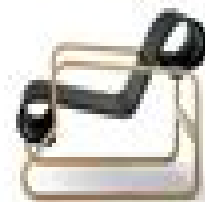
Bauhaus Furniture 1919-1933AD