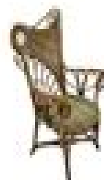
Art Nouveau Furniture 1890-1914AD