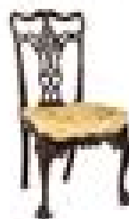
Rococo Furniture 1725-1775AD