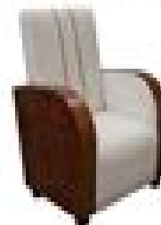
Art Deco Furniture 1925-1940AD