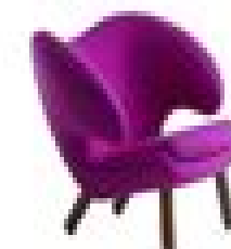
Modern Furniture 1935-1945AD