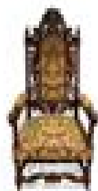
Jacobean Furniture 1567-1625AD