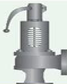
Figure 1: Steam Line Safety Valve

The steam safety valve database containing all relevant information about all safety devices that it can use for yearly inspection of the Section I and Section VIII (code) safety valves. The safety valve database should always be updated with the yearly information from inspections and changes based on plant standards, insurance company recommendations, and federal, state, or local government requirements.