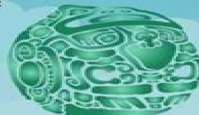
KINICH AHAU Mayan