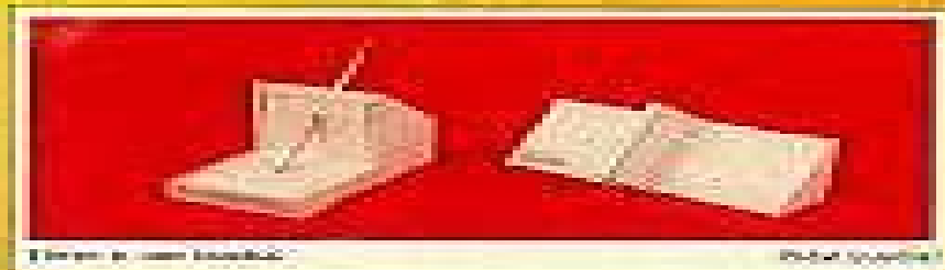
Simple gnomon Sundial