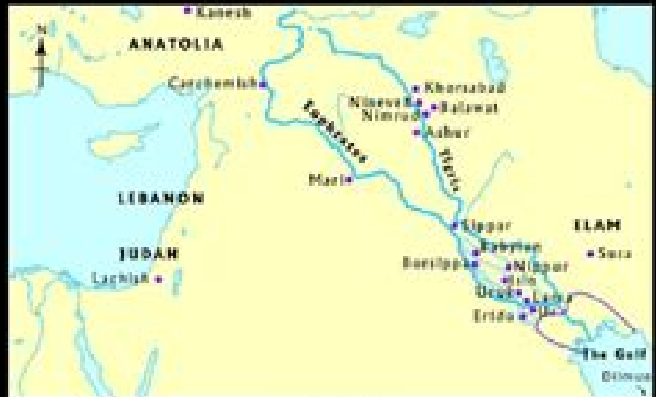
Babylon (56 mi south of modern Baghdad)

Sumer was the first civilization...home of the first cities.