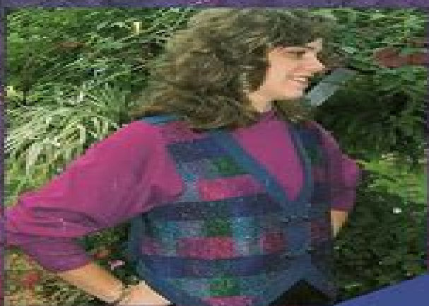
Multi-sized Vest Pattern Included!