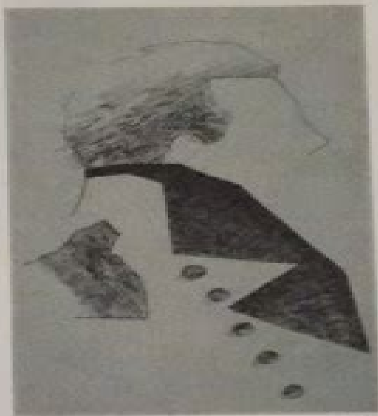
Fort George Parc historique national