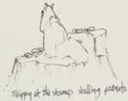
Stumpy at the stump - skulking predators