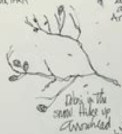
Obey in the snow. Hike up Arrowhead