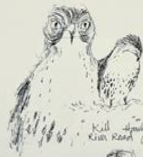
Kill - stump near SEA River Road - Chesham