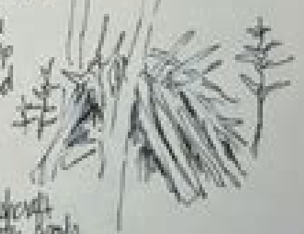
Backwards but in the middle