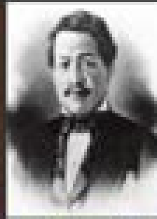
Kamehameha III Kauikoaouli