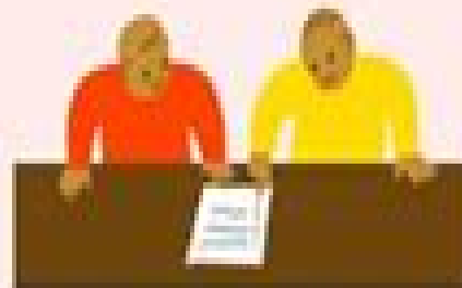
4. Following directions