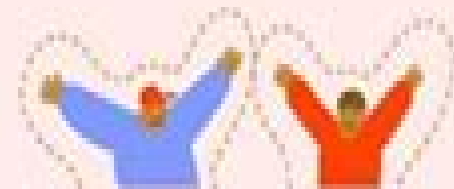
5. Respecting personal space