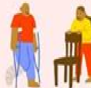
7. Using manners