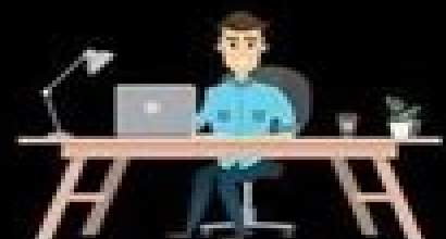
IMPLEMENTING WHAT YOU LEARN