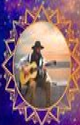
CALEB AUSTON | KIRTAPE

A DAY OF CACAO, MEDITATION AND ECSTATIC DANCE