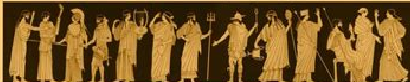
Athena Artemis Apollo Poseidon Hermes Dionysus Hera Zeus Hades

The Greeks believed that gods and goddesses watched over them from Mount Olympus. Every city had a favorite god or goddess. People believed the gods protected them from harm. To please the gods, people brought gifts of money, flowers, food, and drink to temples like the Parthenon.