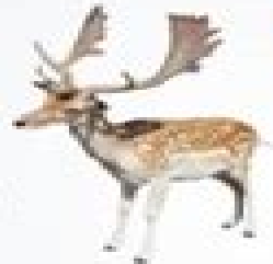
European Fallow Deer