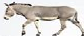
African Wild Ass