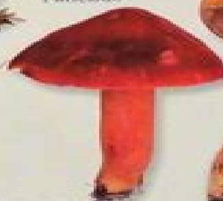
Crimson Wax Cap