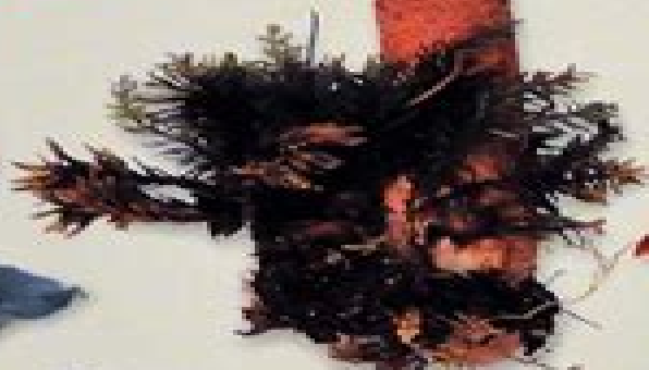
Mottled Poison Cort