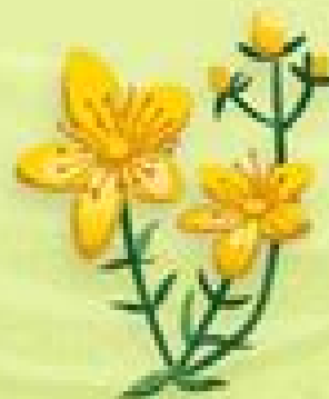
St. John's wort