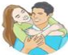
Spending Quality Time with Family/Friends