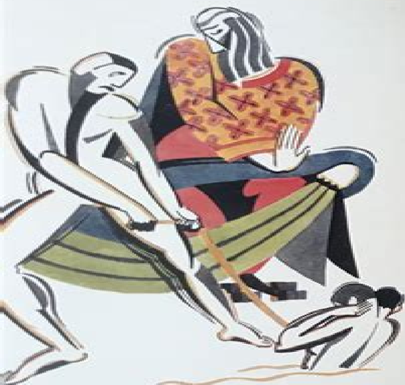
SOLOMON AND THE TWO-HEADED MAN.