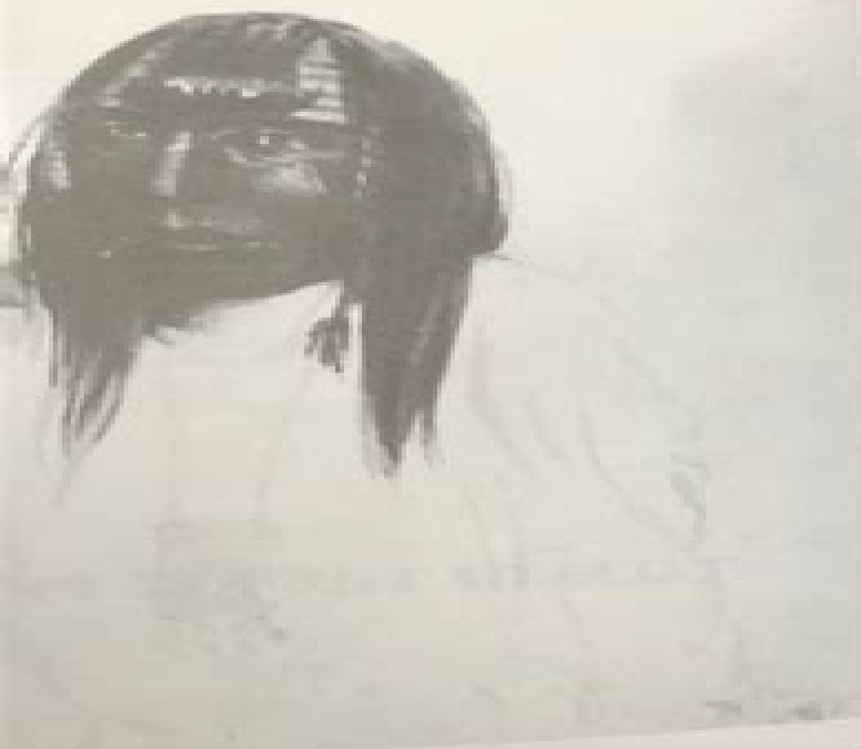
from an early water color by Paul Kane, July 29, 1847. Institute, Photo No. 2987-c)